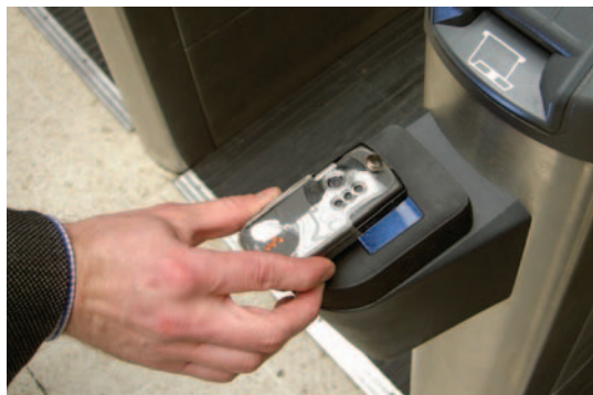
A wide range of technologies will be shown at Coach & Bus Live 2011